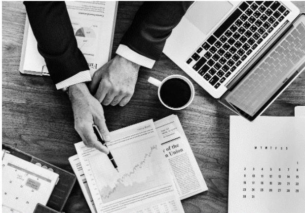
BUSINESS AND TRADE SERVICES