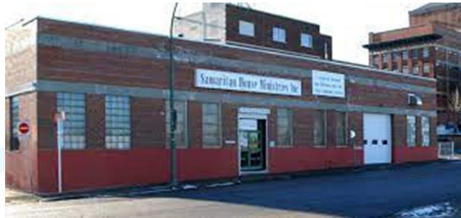
Samaritan House in Brandon