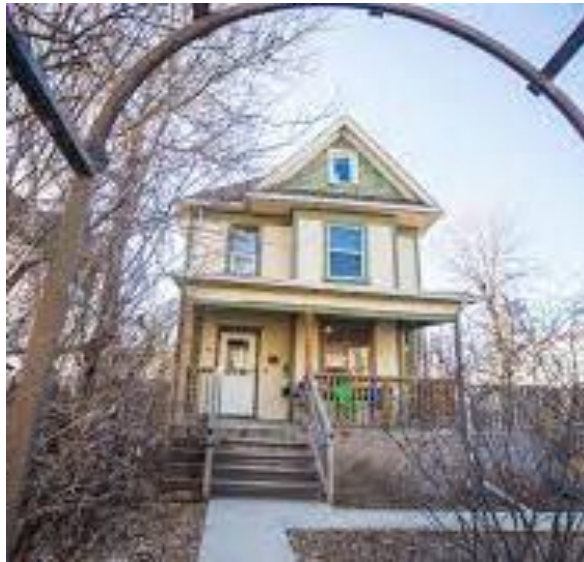
Velma's House in Winnipeg