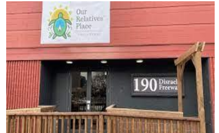
N'Dinawemak in Winnipeg