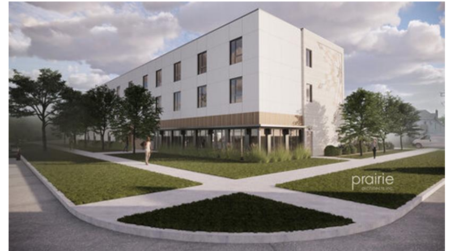
Ross Ellen Housing in Winnipeg