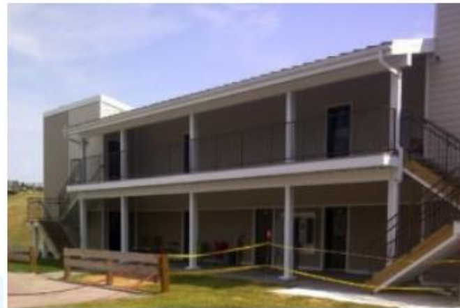
Central House of Hope in Portage la Prairie