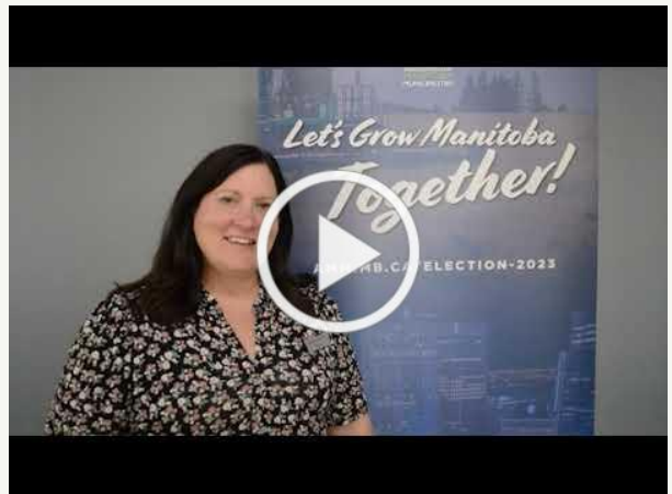
Let's Grow Manitoba Together Mayor Sharilyn Knox The City Of Portage la Prairie