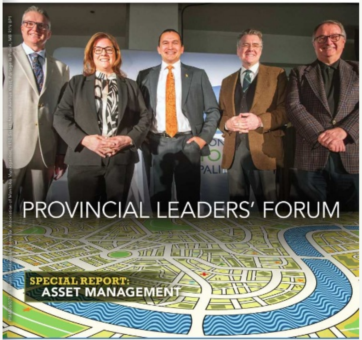
PLUS: AMM Spring Convention Recap • CSO Program a Success in the Town of Ste. Anne

The AMM is gearing up for the provincial election. Our Summer issue recaps our Provincial Leaders' Forum along with the official launch of our <u>Let's Grow Manitoba</u> <u>Together</u> campaign!