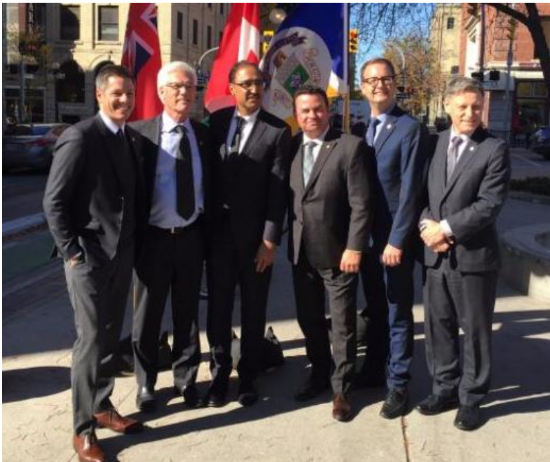
L to R: Mayor Brian Bowman, City of Winnipeg; The Honourable Jim Carr, Minister of Natural Resources; The Honourable Amarjeet Sohi, Minister of Infrastructure and Communities; The Honourable Jeff Wharton, Minister of Municipal Relations; President Chris Goertzen; and Terry Duguid, MP Winnipeg South

On October 10, the governments of Canada and Manitoba announced federal-provincial funding of more than $53.9 million for 11 water and wastewater projects, and more than $21.6 million for