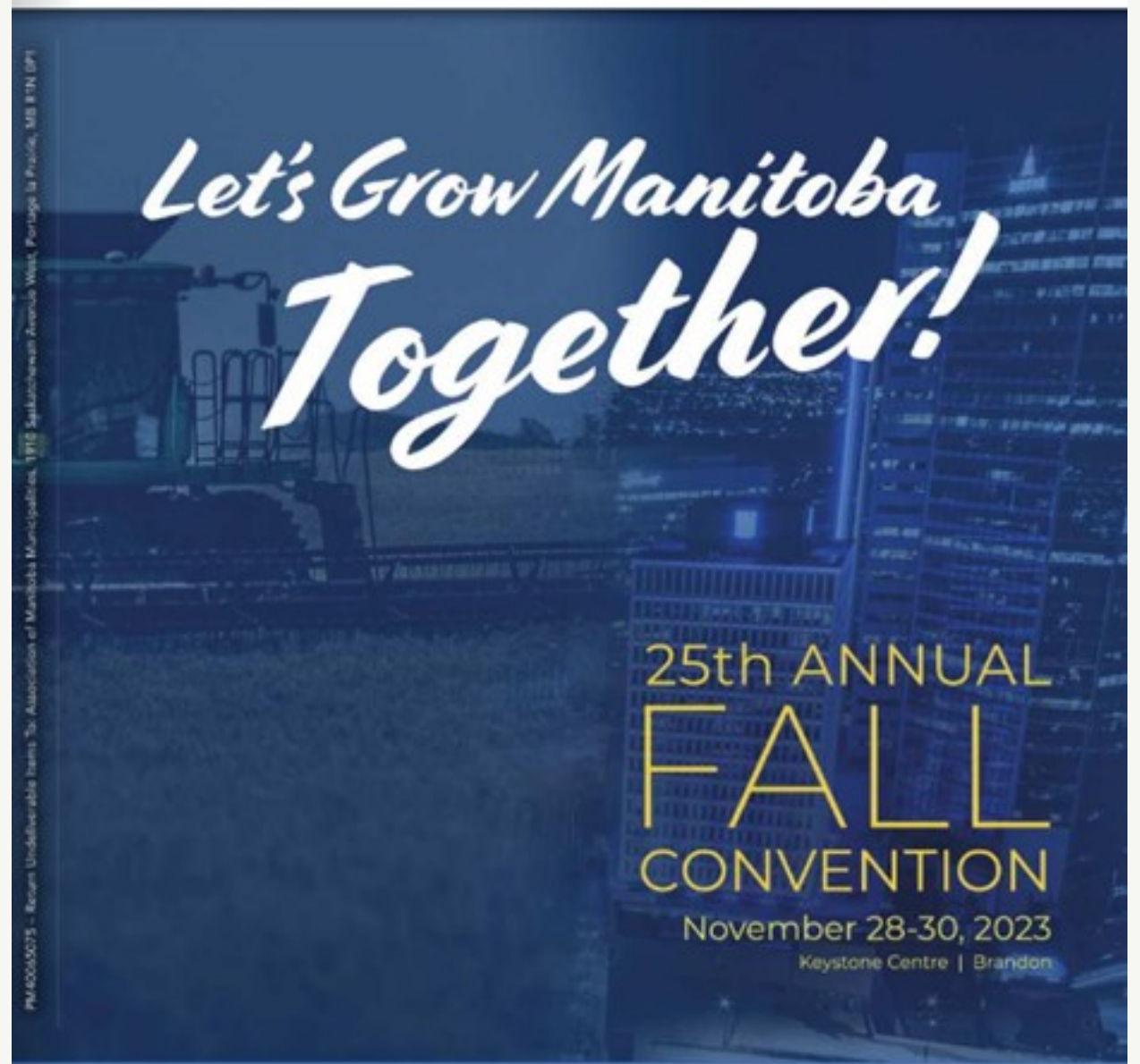
PLUS: What Does the AMM Do for You? • Treaty Land Entitlement

Although snow has arrived across Manitoba, our Fall issue is hot off the press! Flip open the latest issue of the Municipal Leader to learn about our 25th Annual 2023 AMM Fall Convention as well as an update on our "Let's Grow Manitoba Together" Provincial Election Campaign.