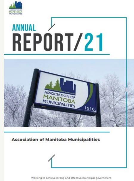
Click photo to view 2020-2021 Annual Report