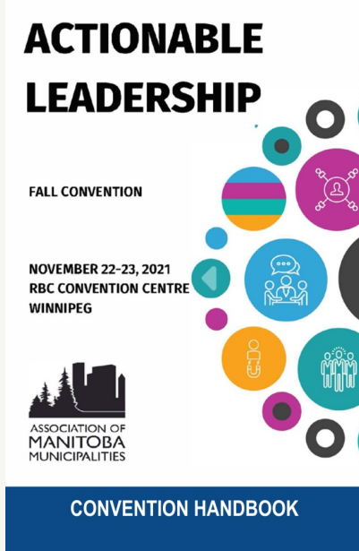
Click photo to view AMM Convention Handbook