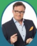
ARLENE DICKINSON KEYNOTE

Comedian and host of CBC's The Debaters.