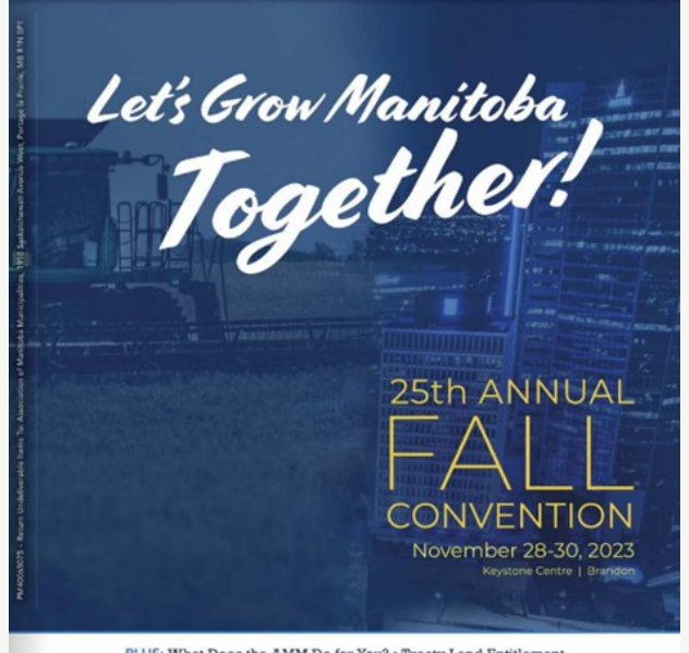
PLUS: What Does the AMM Do for You? • Treaty Land Entitlement

Although snow has arrived across Manitoba, our Fall issue is hot off the press! Flip open the latest issue of the Municipal Leader to learn about our 25th Annual 2023 AMM Fall Convention as well as an update on our "Let's Grow Manitoba Together" Provincial Election Campaign.