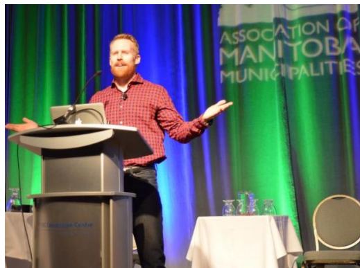
Keynote Speaker Jon Montgomery

The AMM was able to donate to a worthy cause recently, thanks to the generosity of delegates. On Day One of the AMM Annual Convention, Olympic gold medalist Jon Montgomery auctioned off a "beer pitcher" (water jug) for $350 at the end of his keynote address. But that wasn't the end of it - delegates continued to pass the jug