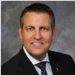
June 3 Justice Minister Cliff Cullen