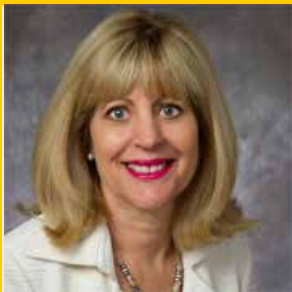
May 27 Sport Culture and Heritage Minister Cathy Cox