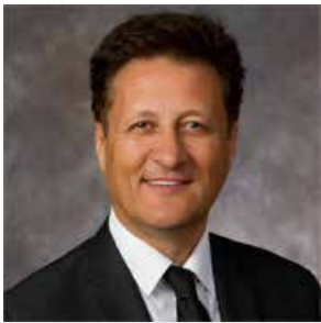
March 2 Infrastructure Minister Ron Schuler