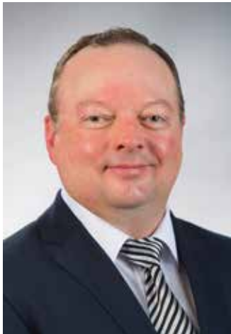
Mayor Stuart Olmstead Western District