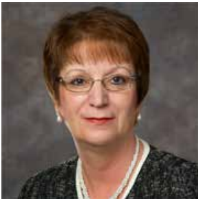
April 23 Indigenous and Northern Relations Minister Eileen Clarke