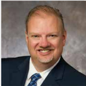
August 4 Education Minister Kelvin Goertzen