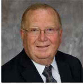
April 20 Economic Development Minister Ralph Eichler