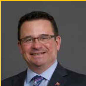
July 21 Crown Services Minister Jeff Wharton