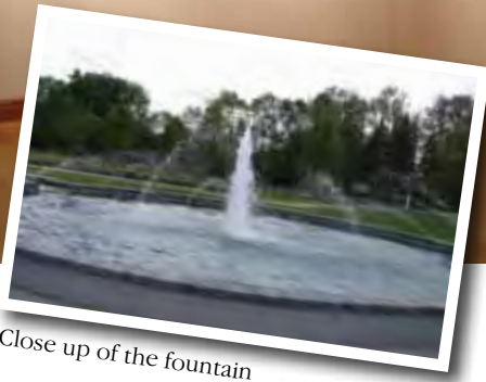
Close up of the fountain