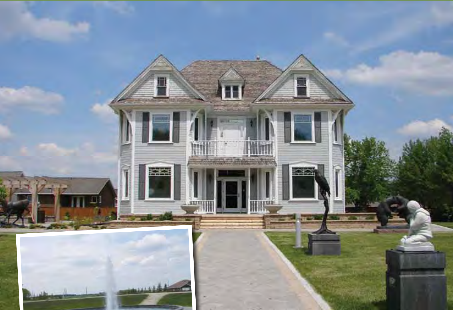
A front view of Schwartz house and the sculpture garden