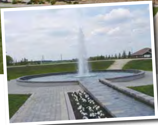
The channel looking towards the fountain

The Municipal Leader is pleased to introduce a regular feature in our magazine – Memorable Manitoba. Encouraged by the interesting, beautiful and often unique attractions in some of the communities visited during this year’s June District Meetings, we felt the Leader is a perfect venue in which to share some of our pictorial impressions with our readers. Our chosen attraction this issue is Altona’s “Gallery in the Park.”