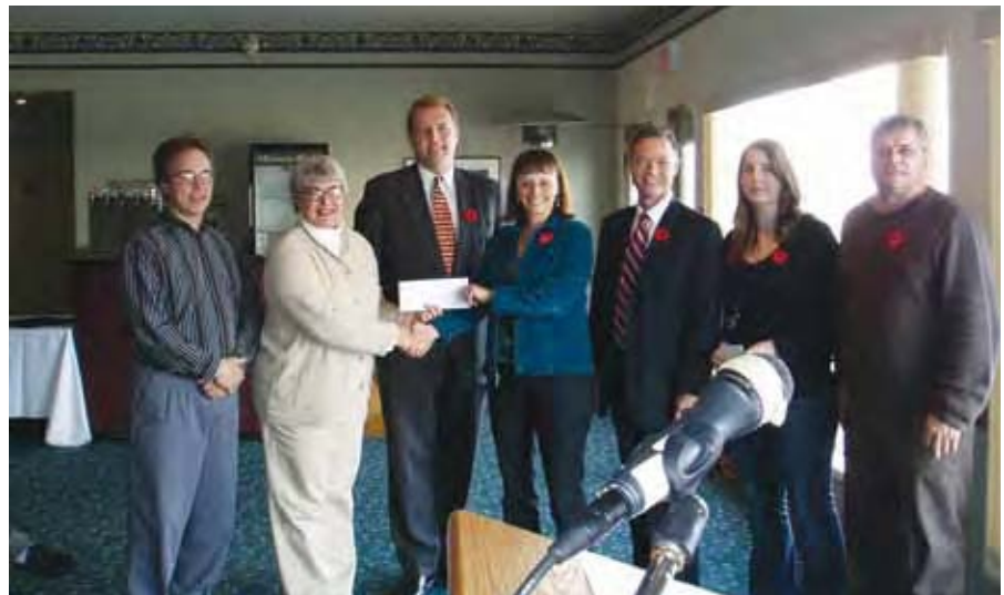
A cheque presentation by Manitoba Government MLAs and Cabinet Ministers to Evergreen School Division, Gimli High School personnel and a YCP and Enviro Club representative for the preparation of a course on Lake Winnipeg Environmental Issues.

attended Community Consultations to report on its activities.