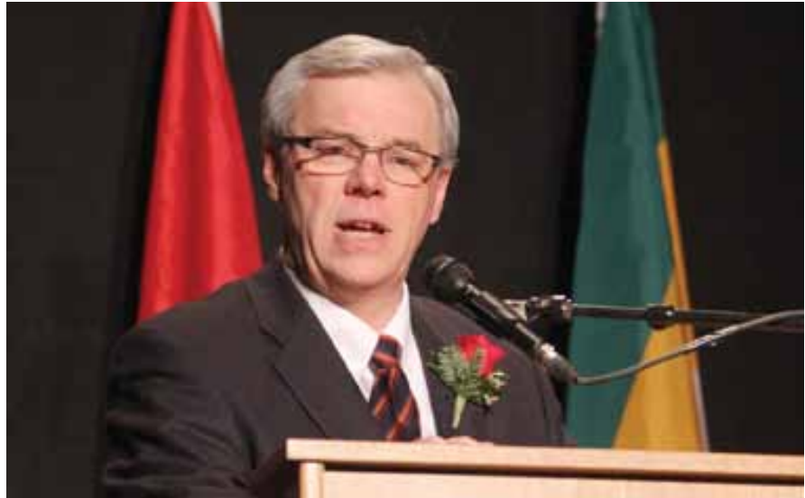
Premier Greg Selinger addressed AMM delegates at the Annual Convention Gala of November 25, 2009.

The AMM is looking forward to working with Premier Selinger in his new role.