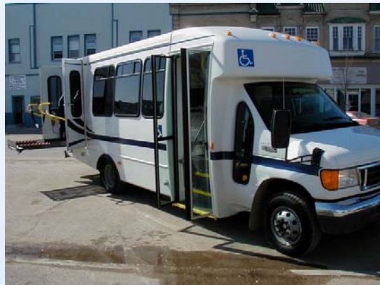
Handi van program