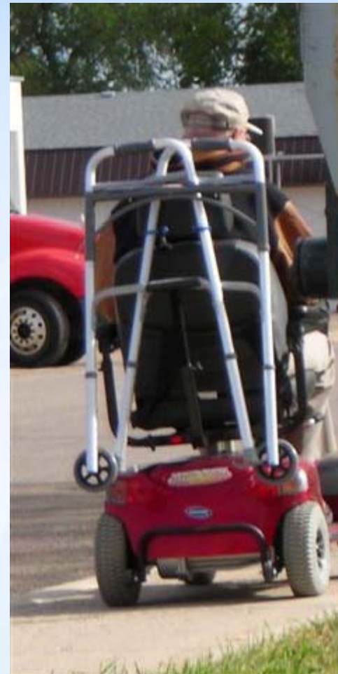
Scooter and walker