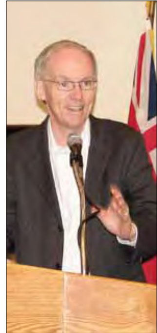
Intergovernmental Affairs Minister Steve Ashton addresses delegates.