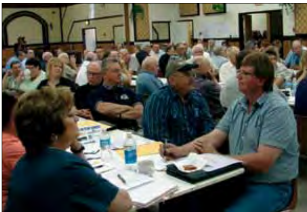
Close to 100 delegates attended the Parkland meeting.