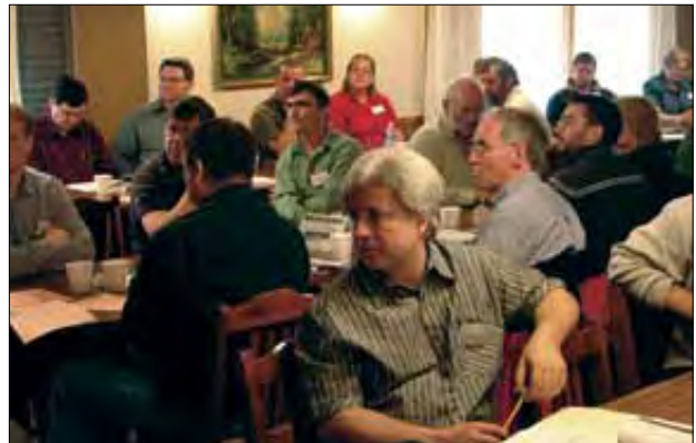
Attendees listen closely to a presentation.