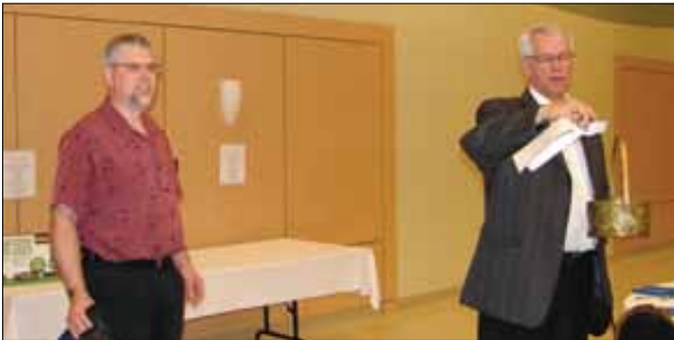
Door Prize draws are an enjoyable part of any district meeting.