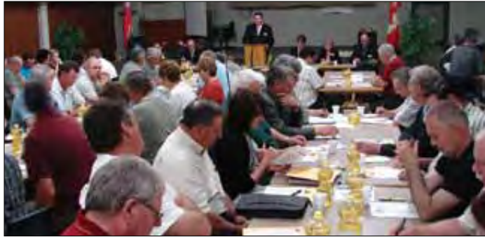
Midwestern delegates all received a bottle of canola oil courtesy of Bunge