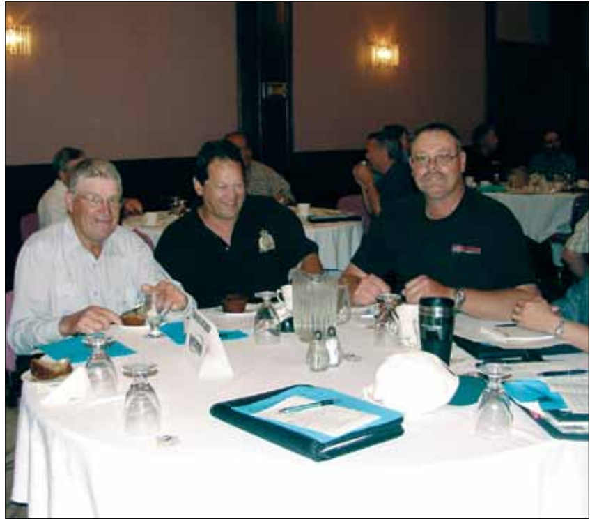
These delegates didn't mind posing for the camera.