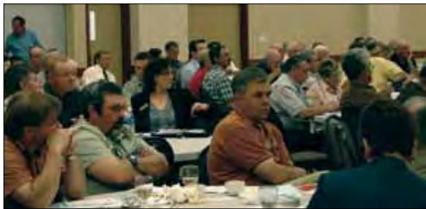
The Western meeting had the highest number of delegates—139.