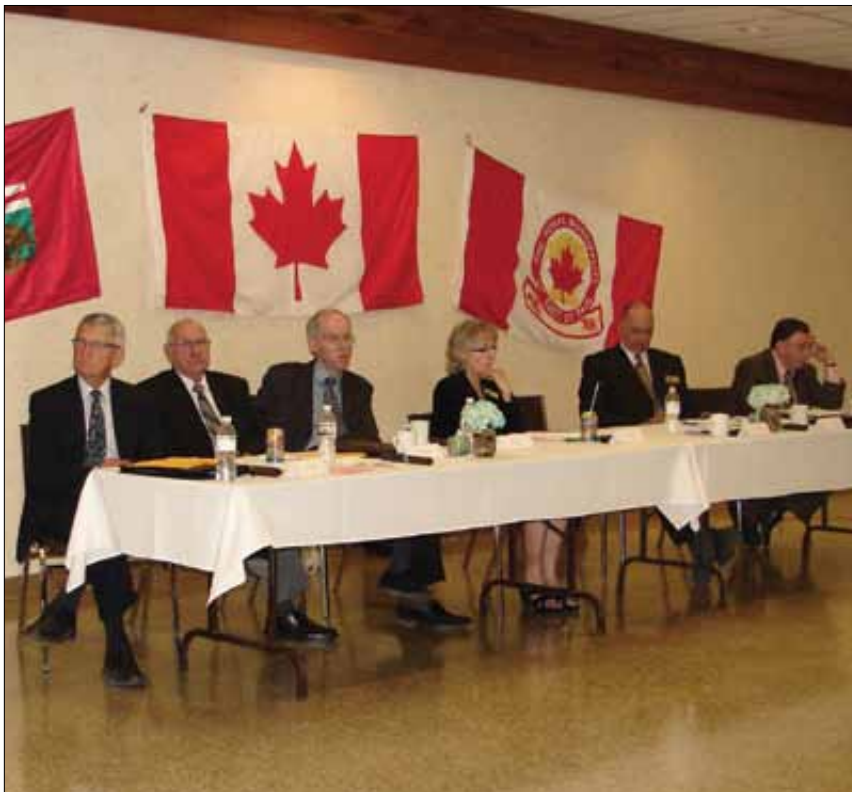
The head table