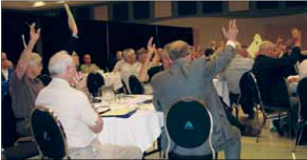
Central District delegates vote on a resolution.