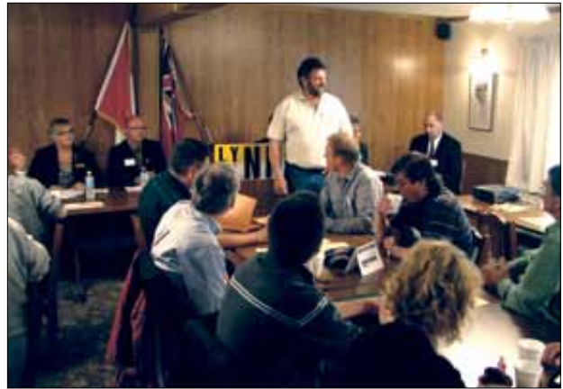
Mayor of Lynn Lake Audie Dulewich brings greetings.