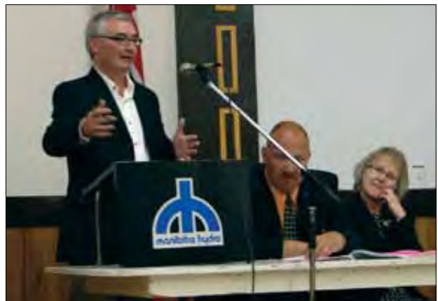
Minister of Conservation Stan Struthers speaks to delegates.