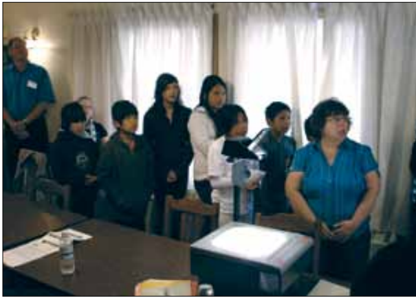
Members of the West Lynn Heights Choir line up to perform O' Canada.