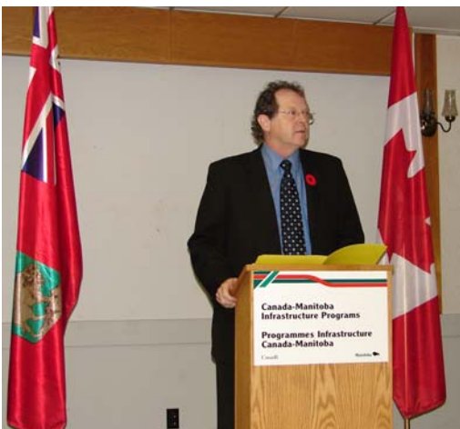
President Bell at RM of De Salaberry announcement in St. Malo last week

The RM of De Salaberry, Village of St. Pierre-Jolys, Village of McCreary, RM of Landsdowne, and the RM and Town of Minitonas will benefit from infrastructure projects jointly announced last week by the Government of Canada and the Province of Manitoba. Funding for the projects is through the Canada-Manitoba Municipal Rural Infrastructure Fund (MRIF) and is based on equal contributions from the governments of Canada and Manitoba, and the local municipality.