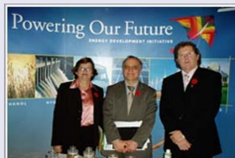
Minister Wowchuk, Minister Chomiak and President Bell at the Nov. 1 announcement

The two main components of the program are geared towards increasing production in Manitoba. Effective immediately, the province will no longer collect the 11.5 cents per litre fuel tax on 100 per cent pure biodiesel. This will offer a tax advantage over regular diesel of approximately 5.5 cents per litre after provincial sales tax has been applied. The provincial tax incentive will be reviewed after four years. The province and Natural Resources Canada will also work together to provide a $1.5-million request for proposals (RFP) support package to Manitoba biodiesel producers who wish to either increase production of biodiesel or to start a new venture. ■