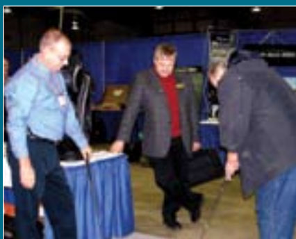
HED's putting green is always a popular spot in the Convention Display Area.