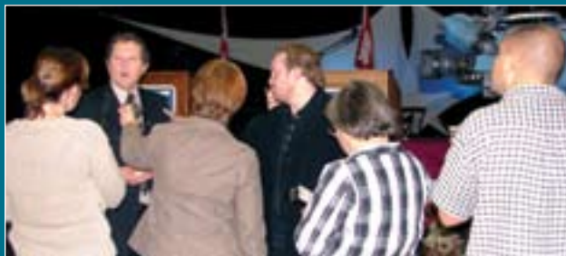
President Bell answers media questions immediately following the Ministerial Forum.