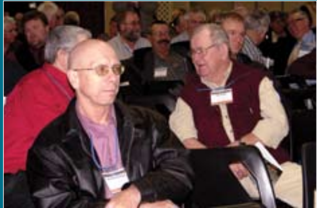
Delegates chat while waiting for a session to begin.