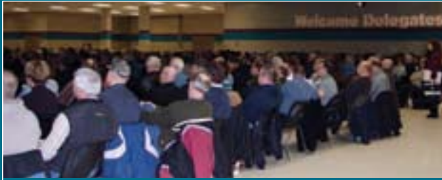
The UCT Pavillion was full for most plenary sessions.