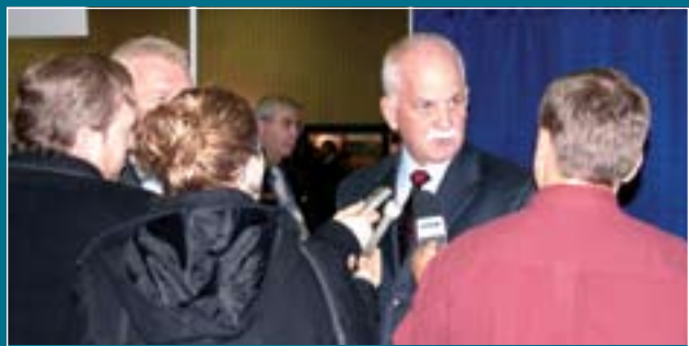
The Honourable Vic Toews responds to reporter's questions following his address to delegates.