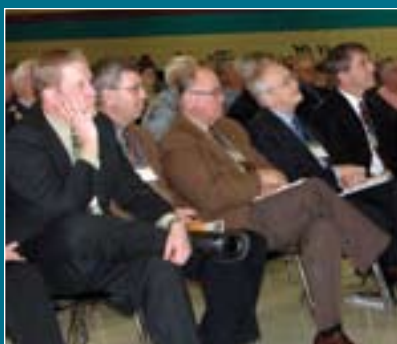
AMM Fraternal Delegates from SUMA, SARM, AAMD&C and FCM listen to the proceedings