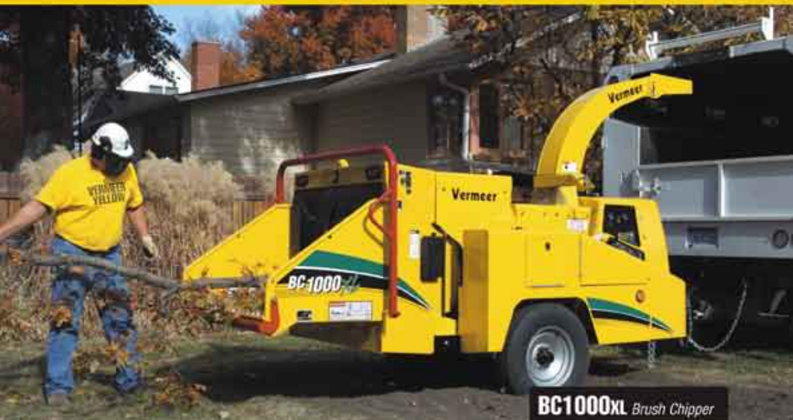
BC1000XL Brush Chipper