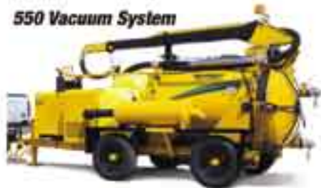
550 Vacuum System