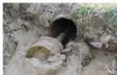
Culvert Cleaning Tools