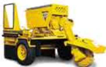
SC752 Stump Cutter