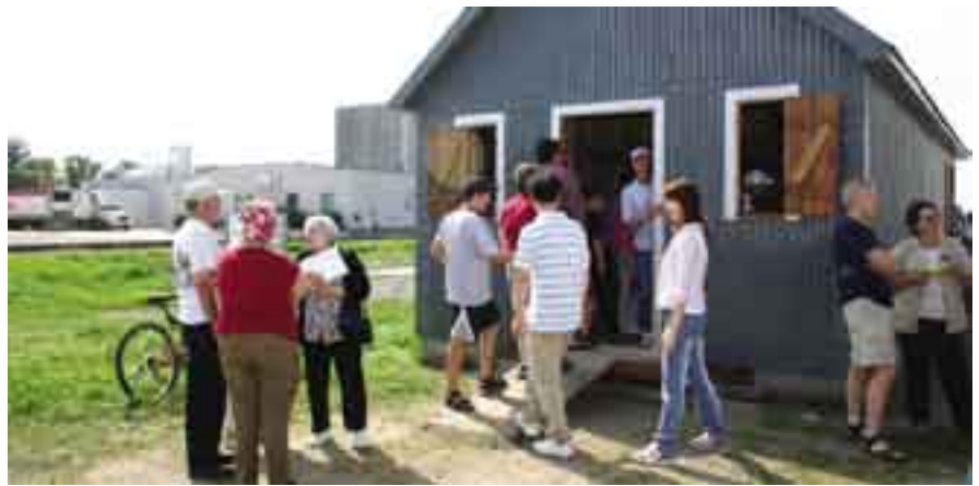
Visitors flock to the new/old gaol even before its Official Opening.